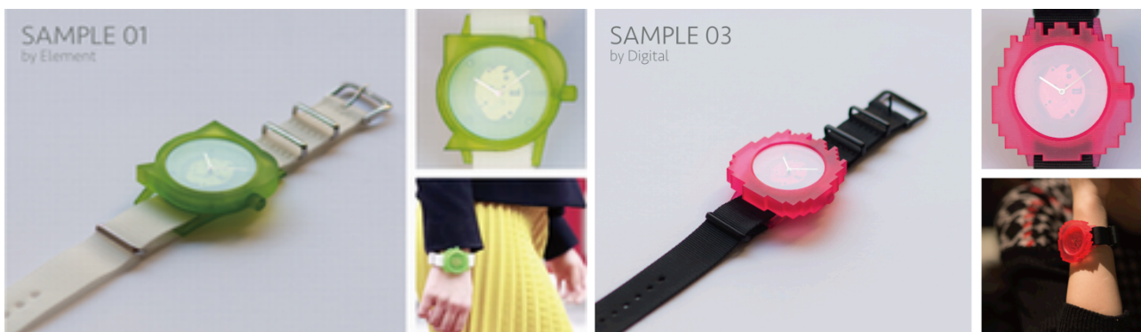
Example of a product

Our original system enables everyone to easily make stylish wristwatches. Unlike the existing made-to-order services (order by combining existing parts or designating the dial design), our service enables you to freely make the shape of your wristwatch by our originally developed WEB interface and the system which automatically generates 3D data in combination with highly precise 3D printing technology.