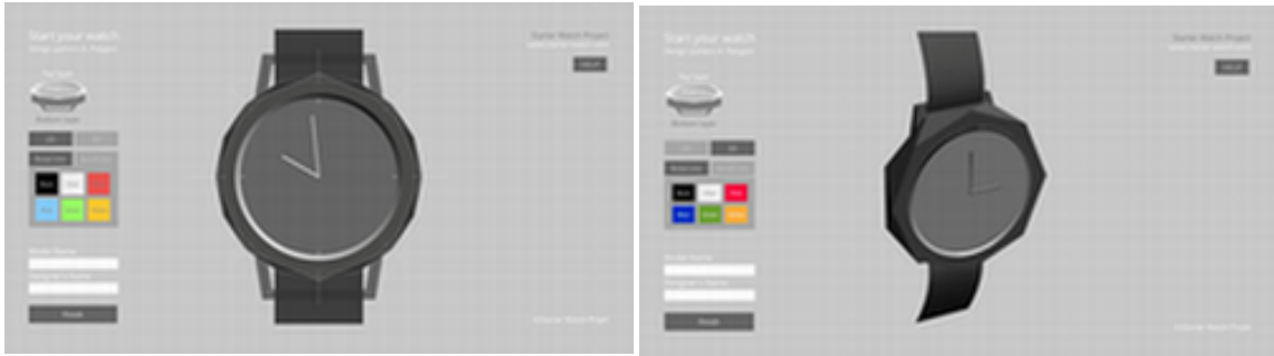
Image of the WEB interface designer

The WEB interface is simply designed so that you can easily make stylish wristwatches. In addition, the 3D printed "Assembly kit" that we send to you is uniquely designed so that you can assemble it with a single tool, included in the kit, without expert knowledge in wristwatches.