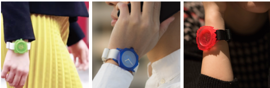
Example of use scene

A wristwatch is a fashion item to express yourself. We propose the lifestyle through this service, not only wearing but also making wristwatches according to your fashion style. Please try this service if you like cool or pretty watches but can't find ones. Not only using for yourself, but for a present to someone important.