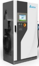
50kW Quick Charger "DCJ503" Series