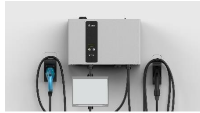
25kW DC Charger "EVDJ25" Series